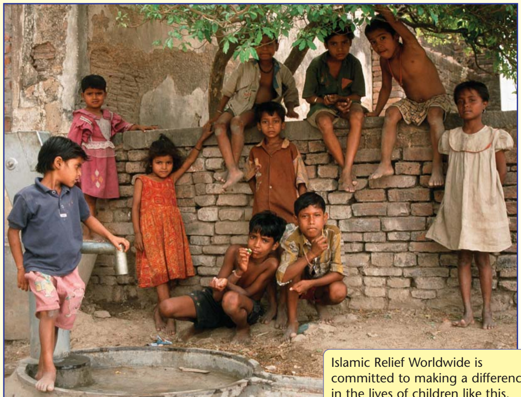
Islamic Relief Worldwide is committed to making a difference in the lives of children like this.

Wars, floods, earthquakes, drought and famine kill millions of people each year. Those who survive often lose their homes and are forced to live for years in temporary housing without clean water or adequate toilets.